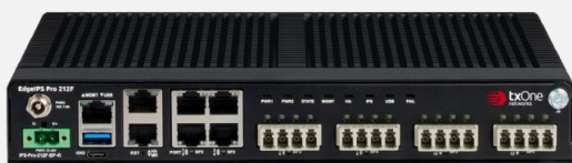
EdgeIPS Pro 212F Rugged

250 mm x 260 mm X 38 mm (9.84 in X 10.23 in X 1.496 in)