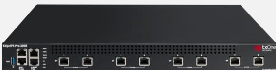
EdgeIPS Pro 2008

438 mm x 650 mm X 44 mm (17.24 in X 25.59 in X 1.73 in)